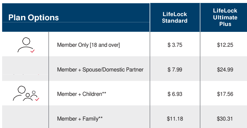
LifeLock service payroll deduction pricing – semi-monthly

LifeLock Ultimate Plus™ service provides some peace of mind knowing you have LifeLock's most comprehensive identity theft protection available. Enhanced services include bank account application and takeover alerts, online credit reports and creditscores.‡